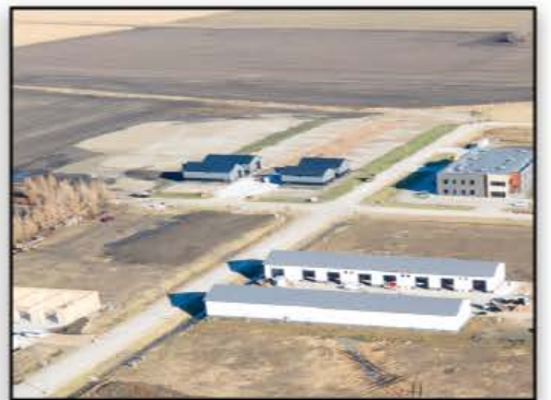
SUITES 11-20 46' x 70' / 3220 sq ft